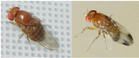
Picture 1: Female (2-3 mm long, left) and male (2 mm long, characteristic two spots on the wings, right) D. suzukii .