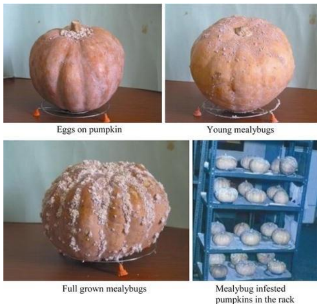
Picture 1: A typical mealybug rearing. Photo: Mani, M., Shivaraju, C., Kulkarni, N.S. (2014) 3 .