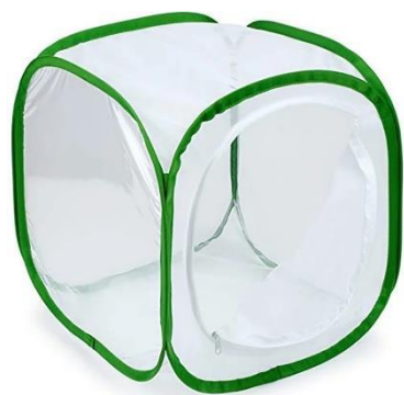
Picture 3: Cages may be purchased online. Cages of 30x30x30 cm are suitable for the parasitoid and cost around 15-30 € depending on the site.