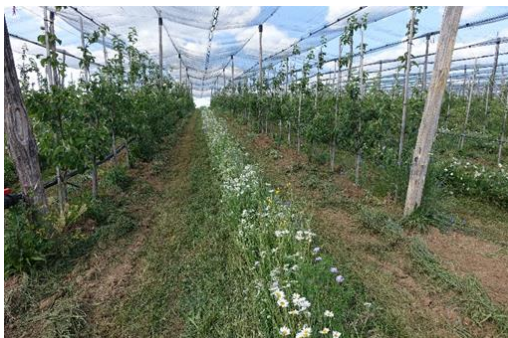
Picture 1: High fringe at the border.