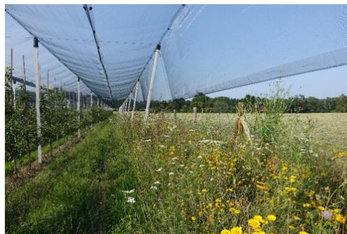
Picture 2: High fringe at the border.