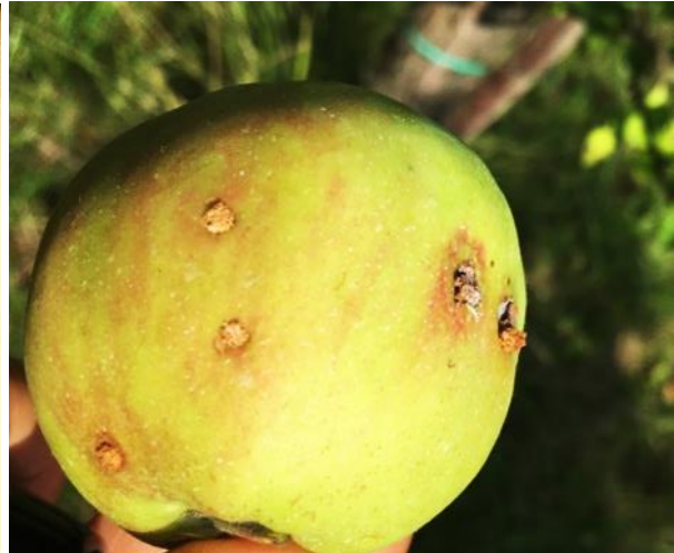
Picture 2 Apple with multiple infestations.