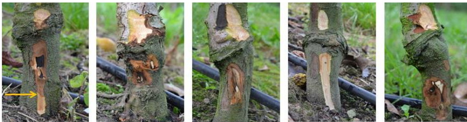
Rootstock not covered with mushroom compost during the winter 2011-2012